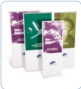
Available in four widths.