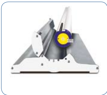
The banner is well protected during transport.