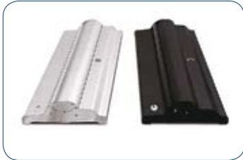
Select the colour according to the message.