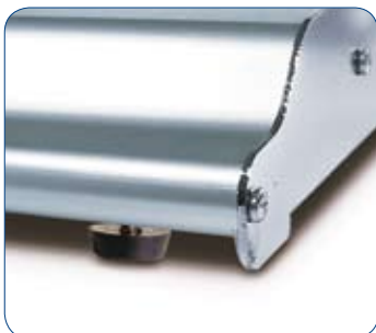
An adjustable foot compensates for uneven floor surfaces.